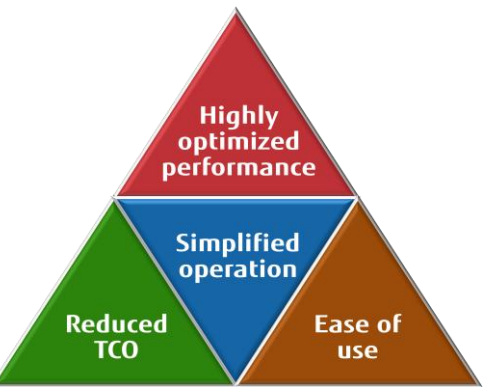
Benefits of the FUJITSU Software HPC Cluster Suite

Fujitsu HPC systems, being delivered with standards-based Intel® Cluster Ready, can dramatically reduce cluster purchasing complexity, accelerate your cluster deployment timeline and simplify your cluster management through the use of the Intel® Cluster Checker diagnostic tool. Intel® Cluster Ready becomes the "quality assurance" standard for your cluster purchase.